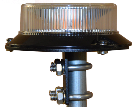
(Pole not included)